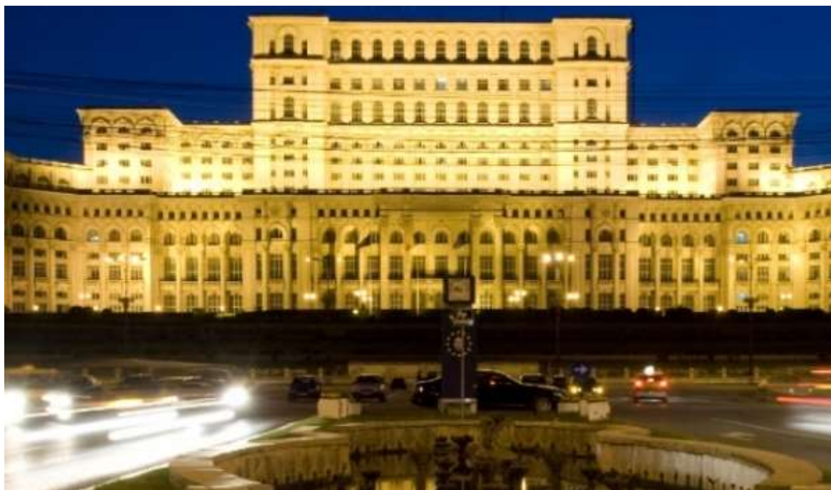
Palace of Parliament - Venue for the 8th Annual Forum

More information on the venue, the services it provides and his cultural program can be found at http://cic.cdep.ro/en .