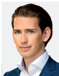
Sebastian Kurz Federal Minister for Europe, Integration and Foreign Affairs, Austria