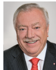
Michael Häupl Mayor and Governor of Vienna