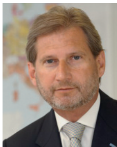
Johannes Hahn Member of the European Commission

The 3 RD ANNUAL FORUM OF THE EUSDR is a big opportunity to meet, discuss and decide the future of the Danube Region. It is about perspectives for our citizens. We look forward to meeting you in Vienna.